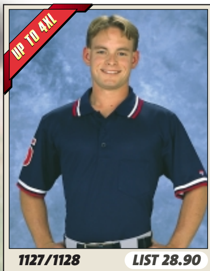
1127/1128 LIST 28.90

Style: Adult Pro-Style Umpire's shirt Fabric: Polyester Air mesh Features: Moisture absorbent finish Soil release fabric Authentic 3 button placket Generous sizing Knit 3 color collar Front pocket Colorfast to hold color Teamwork logo Sizes: S- 4XL Add(2X-$4, 3X-$8, 4X-$12)