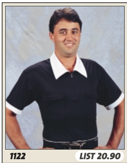
1122 LIST 20.90

Style: Adult Soccer Official's Jersey Fabric: 100% warp knit polyester Features: Nylon half zipper front Two chest pockets with flaps and pen sleeve Fully lined collar White sleeve trim Reinforced construction Sizes: S - 2XL Add(2X-$4)