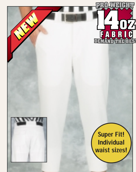
3120 LIST 32.90

Style: Adult Official's Pants Fabric: Pro weight double-knit polyester Features: Wide elastic waist Two snap closure / zipper fly Front slash pockets Two deep-cut rear pockets - one with cover and button closure Sizes: 28, 30, 32, 34, 36, 38, 40, 42, 44 Add (44-$4)