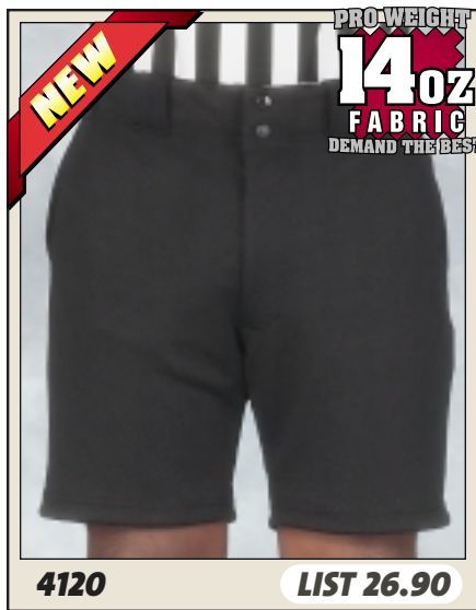
4120 LIST 26.90

Style: Adult Official's Shorts Fabric: Pro weight double-knit polyester Features: Wide elastic waist Two snap closure / zipper fly Front slash pockets Two deep-cut rear pockets - one with cover and button closure Sizes: S - 3XL Add (2X-$4, 3X-$8)